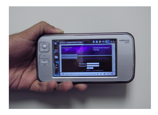
Figure 2. Login page to FLS Interface on Nokia N800.

We have implemented Bluetooth localization using the PyBluez [19] module and BlueZ [20] stack on Linux. The Awarepoint server exports location information both through a database and a web service. We currently use the Awarepoint web service to obtain room level location information.