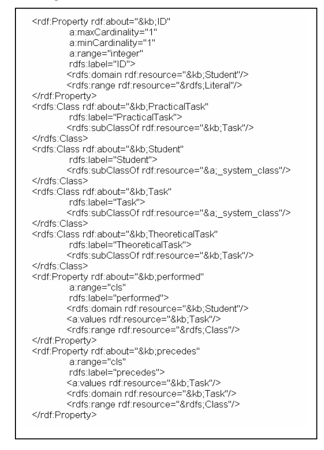
Figure 4. Snapshot of ESR in RDF-S.

streams are in proprietary formats for which no public documentation is available. We are presently working with some of the device manufacturers to understand their formats. One of the simulators used in the initial CAST deployment is shown in Figure 5.