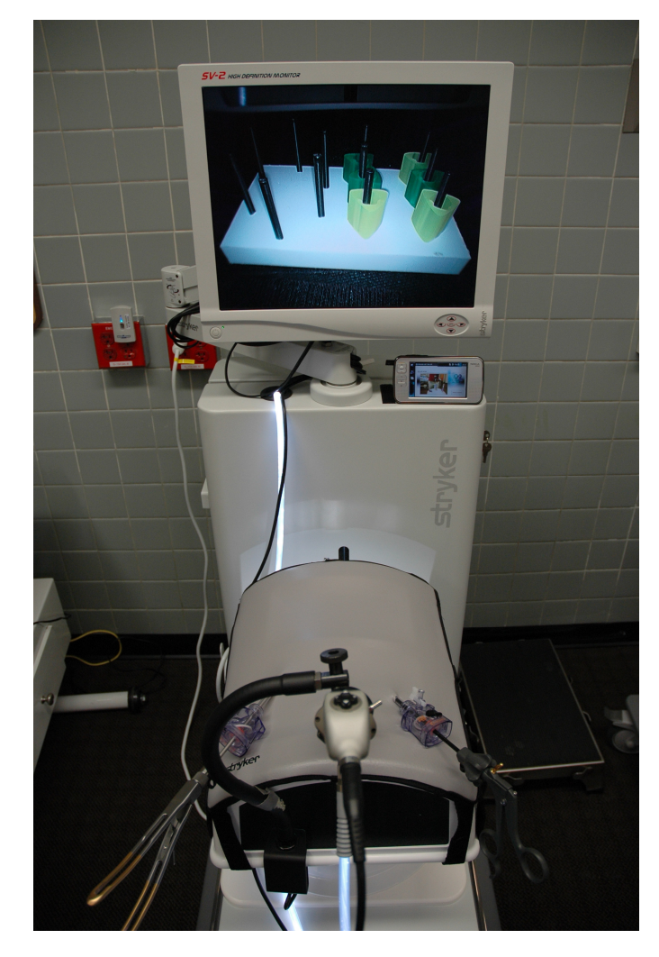
Figure 5. A Laparoscopic Training Simulator with an N800.

In the near future, we will evaluate the impact of such a context aware, ubiquitous system for surgical training in collaboration with colleagues at the University of Maryland Medical System. We will consider the security, effectiveness and efficiency of the system. Other simulators at MASTRI include a ProMIS<sup>TM</sup> surgical simulator as well as a METI<sup>TM</sup> Human Patient Simulator<sup>TM</sup>. The ProMIS<sup>TM</sup> surgical simulator includes performance metrics that have been validated for use with the SAGES FLS program that we intend to use in the ESR. The METI<sup>TM</sup> Human Patient Simulator<sup>TM</sup> provides a log of vital signs during a surgical training procedure. We aim to expand CAST to capture data from these sources as well.