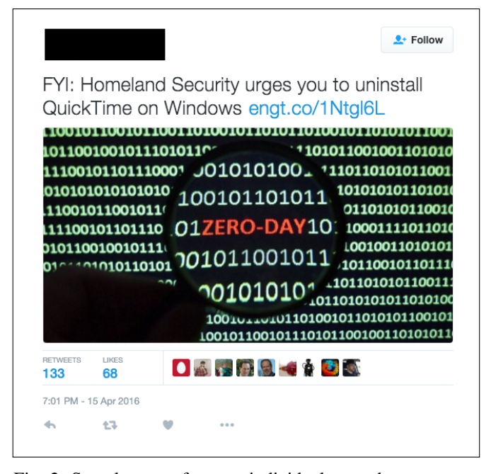
Fig. 2: Sample tweet from an individual user about a recent security vulnerability

Rest of the paper is organized as follows– We discuss related work in Section II, our CyberTwitter framework in Section III. We execute and evaluate our system in Section IV & V respectively. We present our conclusions and future work in Section VI.