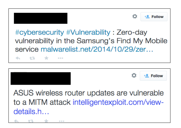
Fig. 1: Both users and organizations use Twitter to report potential threats.

reasoning using this system profile, data in the knowledge base and varying time slices to generate the most relevant and important alerts for human review. Given, the sometimes, unreliable nature of information on Twitter [12] along with the possibility of different local security and organizational policies, we believe that it's best for a human analyst to be ' in loop ' with the system.