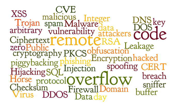
Fig. 4: Data collection keywords.

CyberTwitter collects data through the Twitter Stream API<sup>3</sup> based on a set of keywords. These keywords are derived from the "User System Profile" and a list of cybersecurity terms (see Figure 4). For our system we limit ourselves to tweets in English language<sup>4</sup>. After collecting a good number of tweets we clean the data using WordNet, which is a large lexical database for English [24].