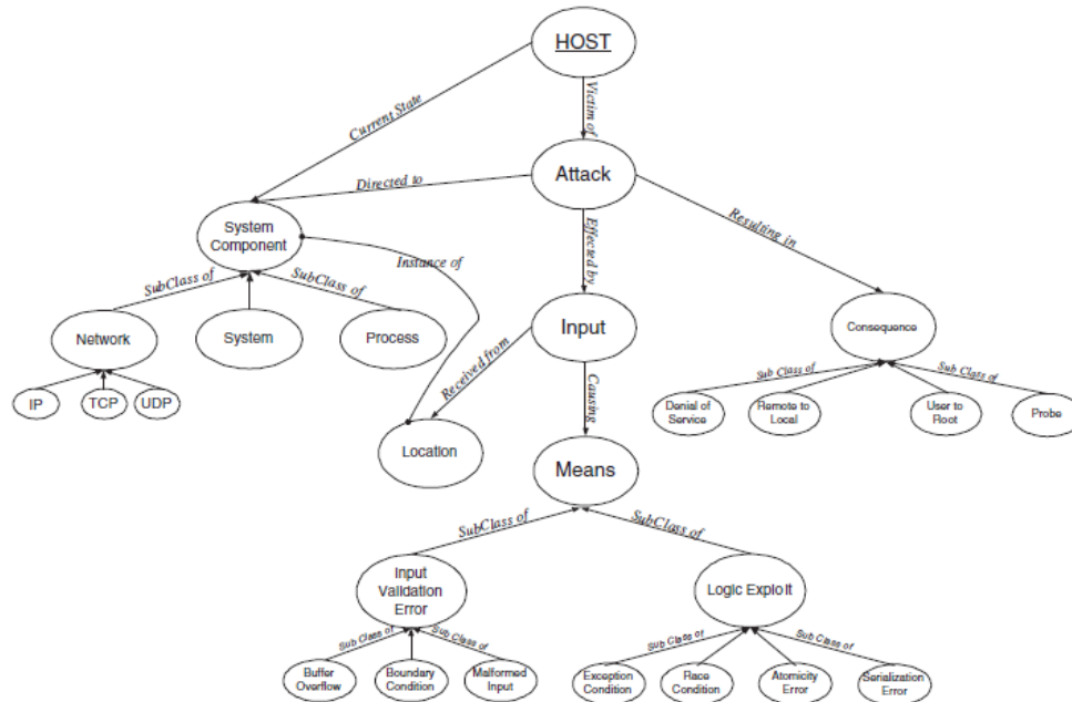
Figure 4. This figure shows a high-level sketch of the IDS OWL ontology from [19].

vulnerability database did not have the signature for the exploit, the attack was not flagged.